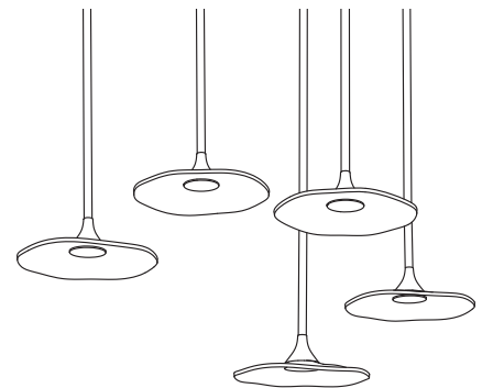
Cluster configurations on request