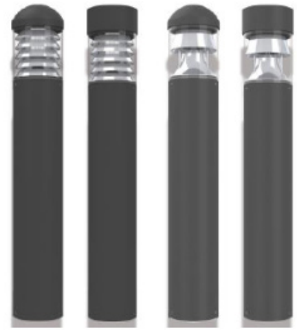
BOL-1603 BOL-1604 BOL-1605 BOL-1606