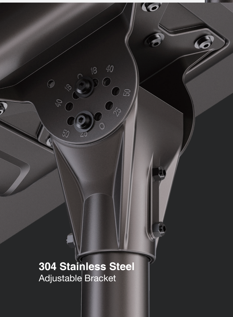
304 Stainless Steel Adjustable Bracket