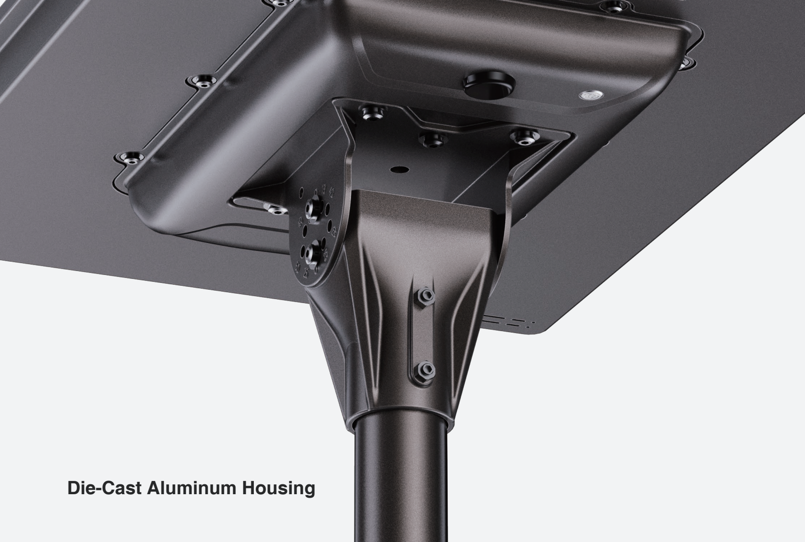
Die-Cast Aluminum Housing